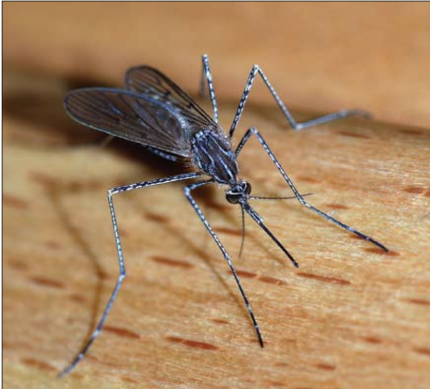
The EPA has officially approved BioUD™ as a safe, active ingredient in insect repellent for direct skin application with no child safety restrictions.